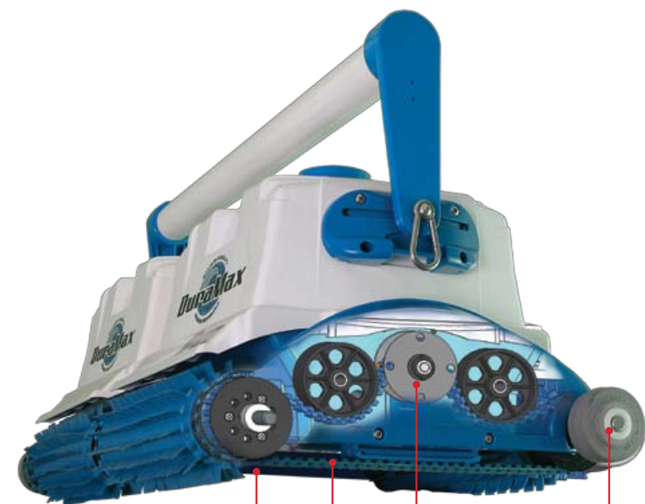
Patented BodyGUARD™ Corner Wheels